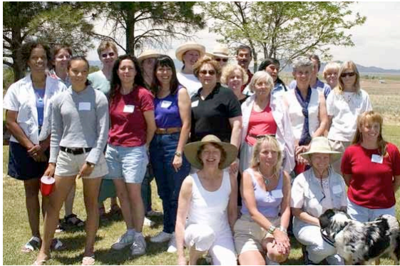
Current and former members gathered in 2004 to celebrate 25 Years of Networking.

Our Annual fall meeting and Technical Symposium provides an opportunity to present technical papers in a supportive environment. It also provides professional development and networking opportunities.